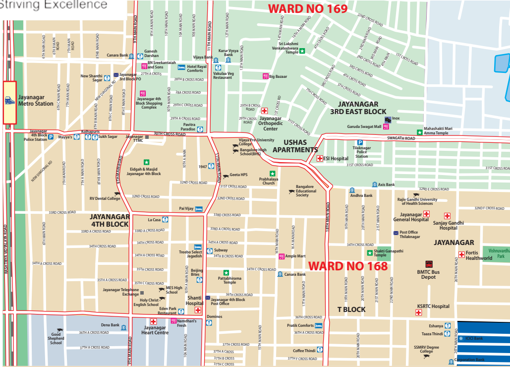
JAYANAGAR WARD MAP